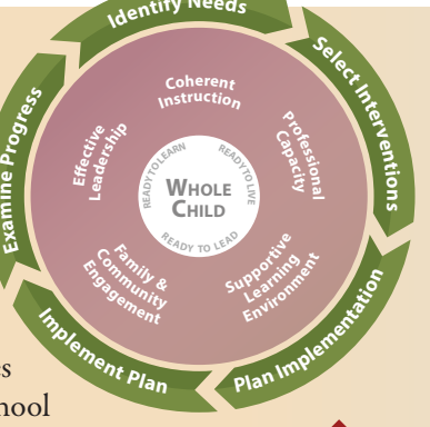
Georgia's Systems of Continuous Improvement

The Georgia State Board of Education and the Georgia Department of Education recognize that parents, schools, and communities must be viewed as equals with shared responsibilities, but schools must take the lead in developing and sustaining these collaborative partnerships to ensure maximum effectiveness. Each partner, however, has a role to play, as clearly outlined in the resolution and statement, and local school officials are strongly urged to use them as a guide in developing local school and district plans and policies. To view the resolution, please visit: http://bit.ly/gadoepac.